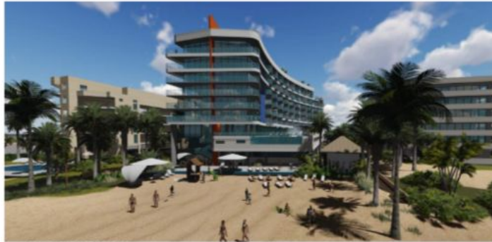
OVERALL BEACH VIEW