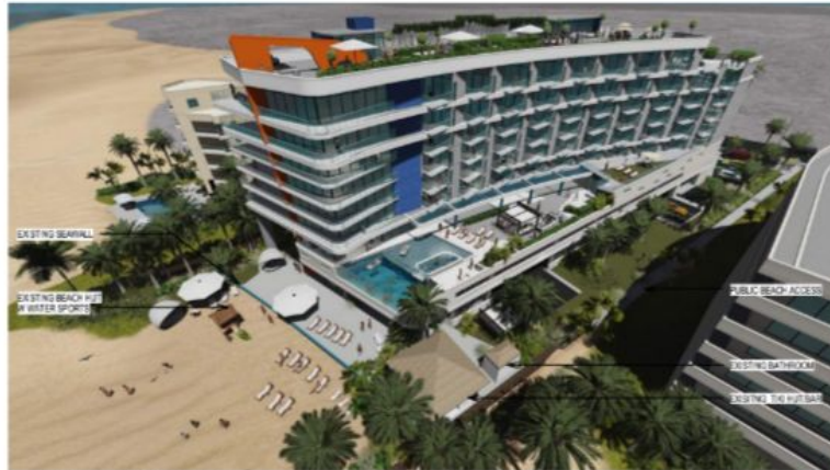
OVERALL BIRD'S EYE VIEW