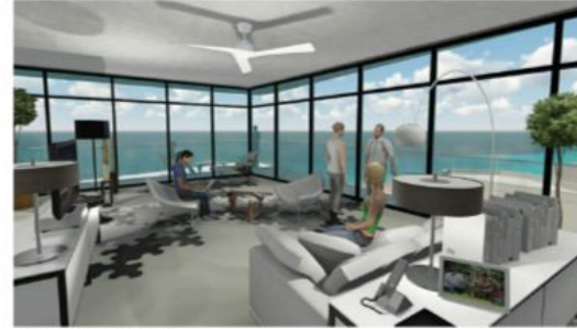
ROOM INTERIOR VIEW