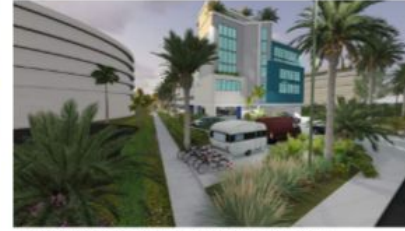
BEACH ACCESS / BICYCLE RACKS / RV PARKING