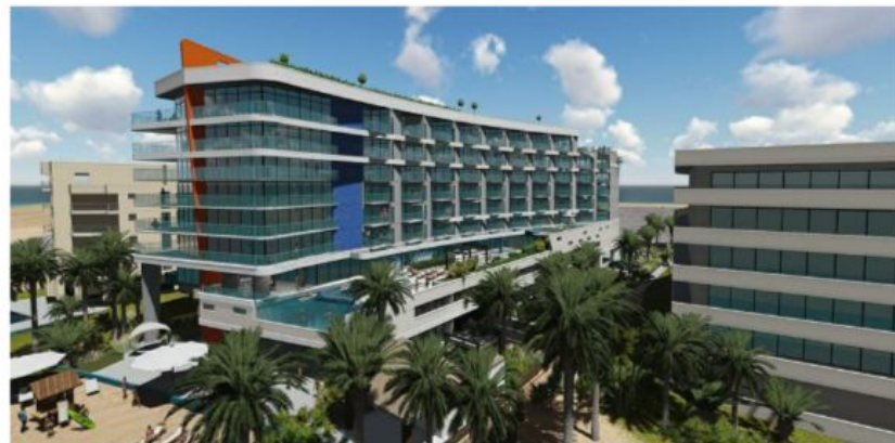
REFERENCE BEACH VIEW