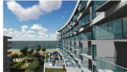
ROOM BALCONY VIEW