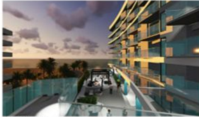
MID DECK VIEW