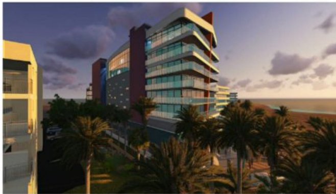
SIDE CORNER VIEW