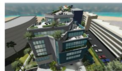
FRONT FACADE DECK / BALCONIES